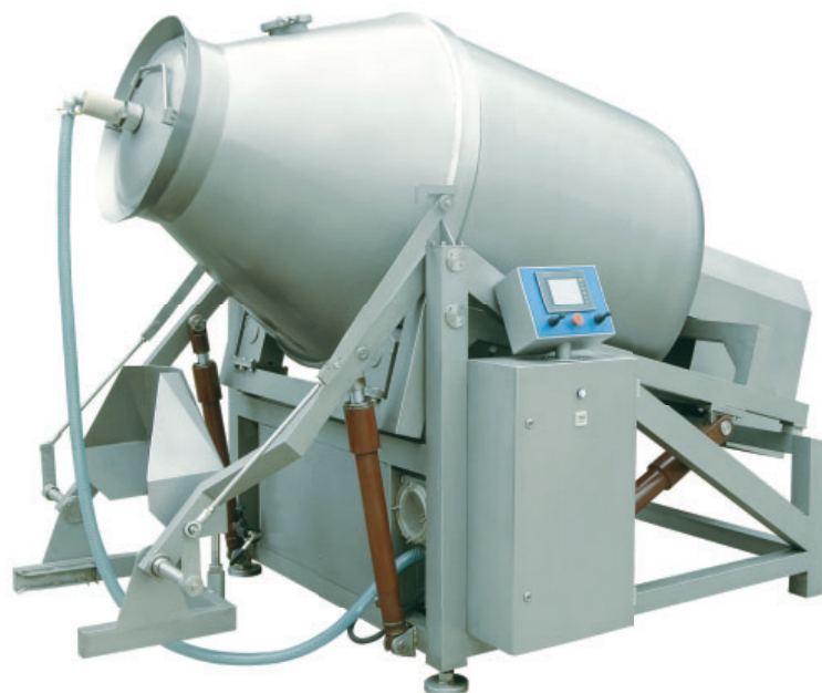
IVT-1700 shown with loading device