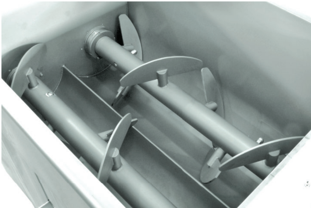
Mixing paddles on the FM-230