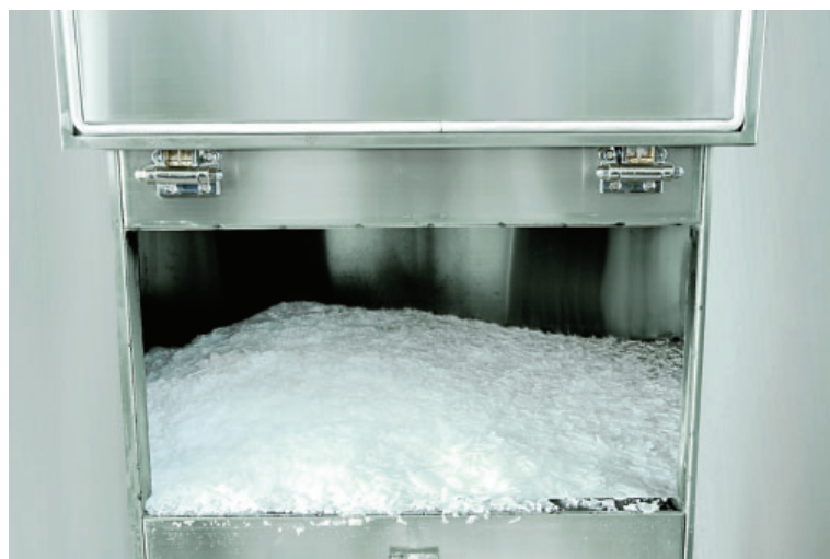
FIM-100 Ice Maker Outlet