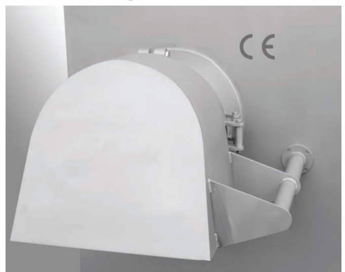
FG-300 shown with guarding