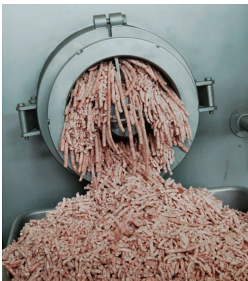
FG-300 on Frozen Meat