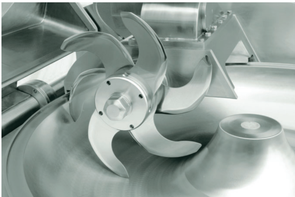
Cutting set on the FBC Series